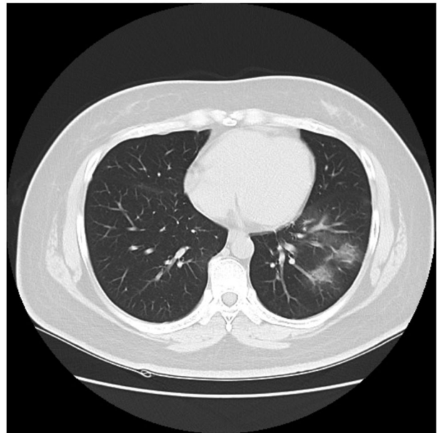
Figure 1. Computed tomography scan showing slight ground-glass opacity in the left lower lobe of the lung.

The patient was a 35-year-old woman without a significant medical history. On January 21, 2020, she travelled to Japan from Wuhan, China. She was healthy until January 30 when she developed fever with mild diarrhoea. On January 31, at the primary care clinic, the rapid influenza antigen test was negative. Chest X-ray revealed signs of pneumonia in the left lower lung and she was transferred to the Japanese Red Cross Narita Hospital. She denied having sore throat, rhinorrhea, chills and cough. She had not visited Huanan market and was not exposed to any wild or dead animals. On admission, her vital signs were as follows: blood pressure 106/66 mmHg, heart rate 93 beats/min, body temperature 37.9°C, respiratory rate 16 breaths/min and oxygen saturation on room air 97%. Her physical examination was unremarkable. Laboratory test results did not reveal leukocytosis, leukocytopenia or elevated liver function enzymes. Computed tomography (CT) scan showed slight ground-glass opacity in the left lower lung lobe (Figure 1). She was admitted to an isolation room with negative pressure. Ceftriaxone and azithromycin were administered after obtaining a throat swab. The PCR test on the throat swab for the novel coronavirus (SARS-CoV-2) was negative. Her fever persisted but she had no respiratory symptoms such as cough. On hospital day 5, induced sputum and a second throat swab were obtained. The PCR test on induced sputum was positive but the throat swab was still negative. Her